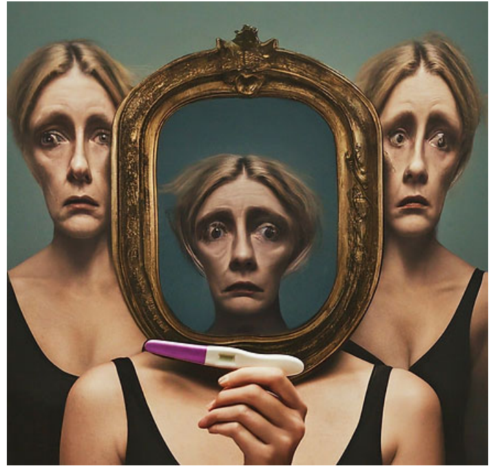
Mockup Draft 2 for Show Image